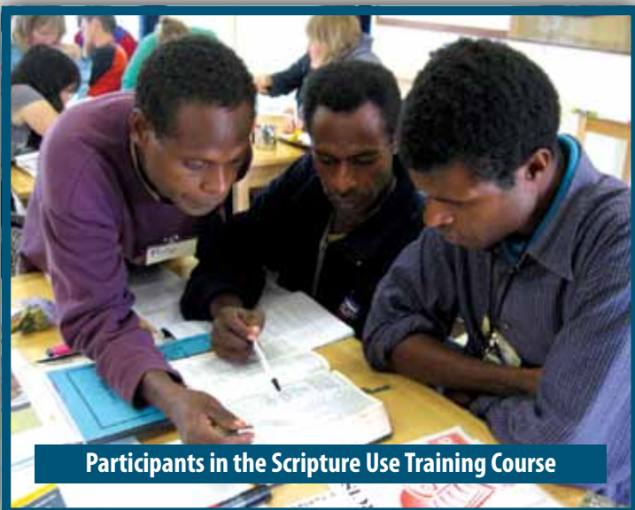
Participants in the Scripture Use Training Course