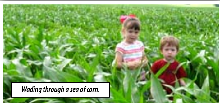
Wading through a sea of corn.