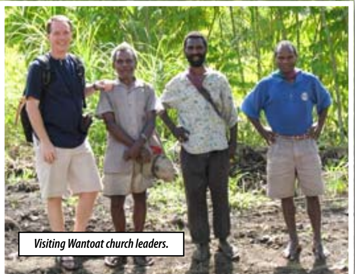
Visiting Wantoat church leaders.